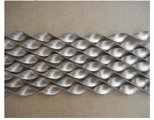
Fig. 1 : Twisted Tape

In general, swirl flow generators are placed in the flow passage to augment the heat transfer rate, and this reduces the hydraulic diameter of the flow passage. Heat transfer enhancement in a tube flow by inserts such as twisted tapes, screw tape is mainly due to flow blockage, partitioning of the flow and secondary flow. Flow blockage increases the pressure drop and leads to increased viscous effects because of a reduced free flow area. Blockage also increases the flow velocity and in some situations leads to a significant secondary flow. Secondary flow further provides a better thermal contact between the surface and the fluid because secondary flow creates swirl and the resulting mixing of fluid improves the temperature gradient, which ultimately leads to a high heat transfer coefficient. Fig. 1 shows a typical configuration of twisted tape which is used commonly.